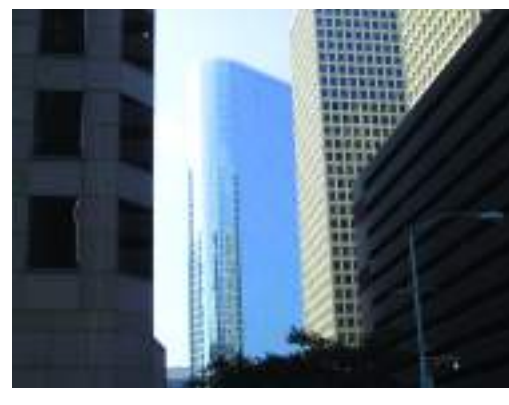
4 Allen Center Houston, TX