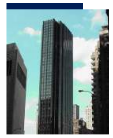
Trump International Hotel New York, NY